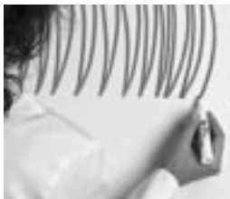
Use Egan Markers to draw/write on the EVS or EganBoard surface.

MSDS Info: Egan Markers contain no materials in sufficient quantities to be toxic or injurious to humans, or to cause acute or chronic health problems. The markers show conformance to quality standards and comply to ASTM D 4236 and the U.S. Labeling of Hazardous Art Materials Act (LHAMA).