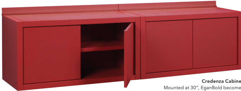
Credenza Cabinet Mounted at 30", EganBold becomes a great credenza system.