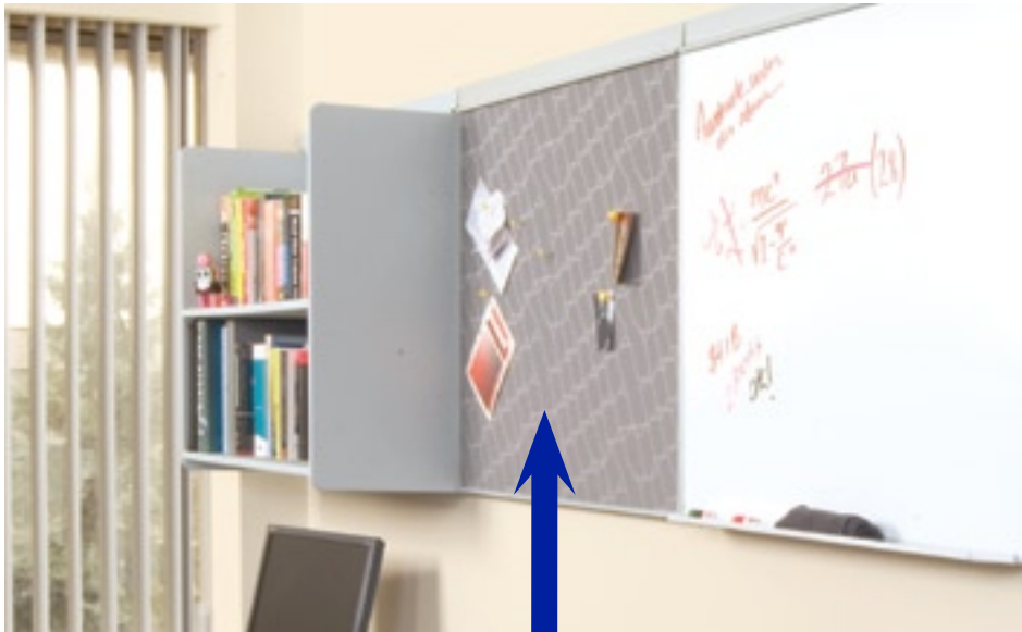
Private office move completed.