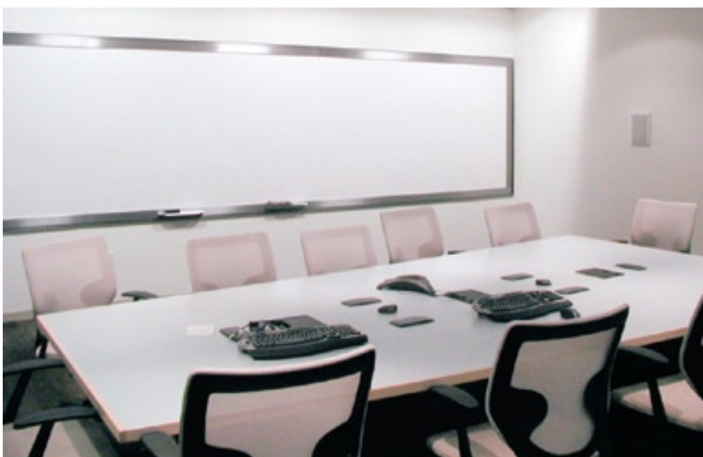
EganWall – 30'w x 54"h Finished with customers own frame and marker trays.