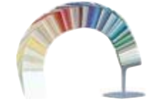
Optional Color Available