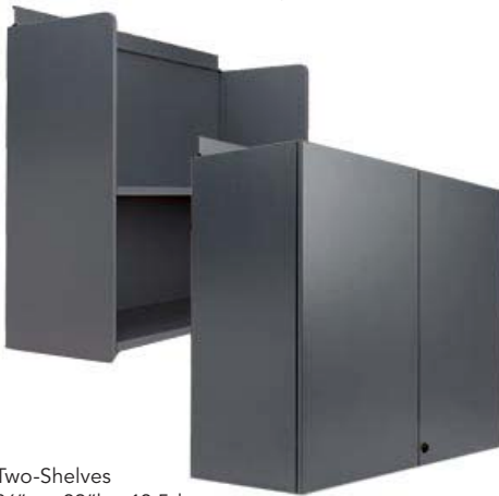
Two-Shelves 36" w x 29" h x 12.5d