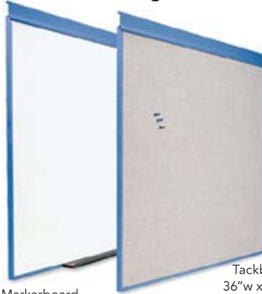
EVS Markerboard 36" w x 43" h