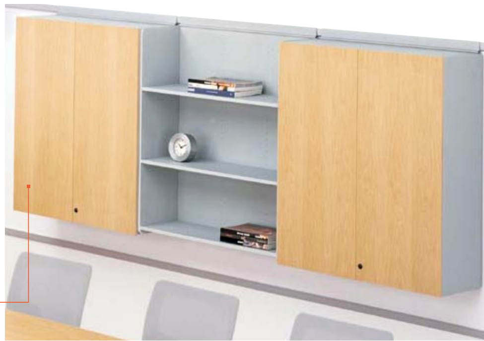
43" Maple Cabinets and Metalic Shelf suit this Training Room