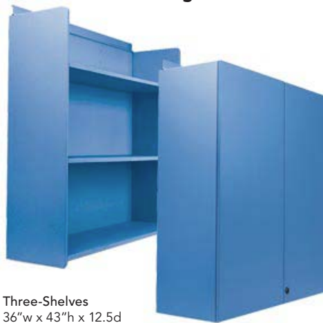
Three-Shelves 36" w x 43" h x 12.5d