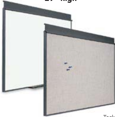
EVS Markerboard 36" w x 29" h