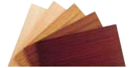
Custom Stain Available