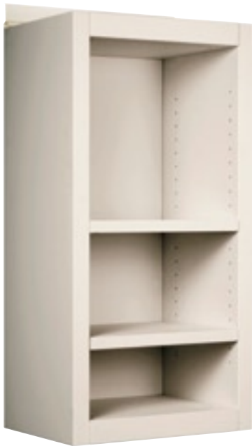
18" w x 42" h: Putty Etex shelves in vertical format.

This unique combination makes EganSystem approved for California State Office of Statewide Health Planning and Development (O.S.H.P.D.).