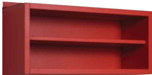
42" w x 18" h: Custom color Etex shelves without doors.