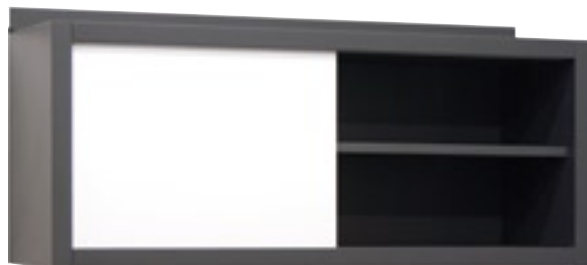
42" w x 18" h: Charcoal Etex shelves with sliding doors.