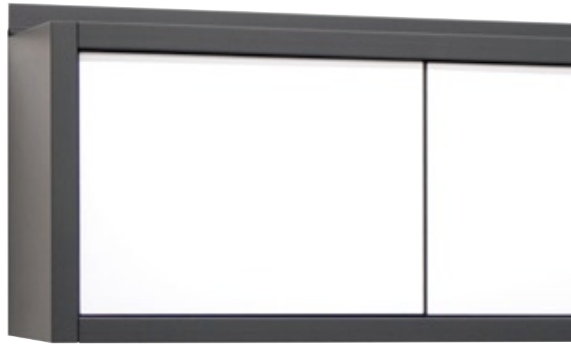
42" w cabin