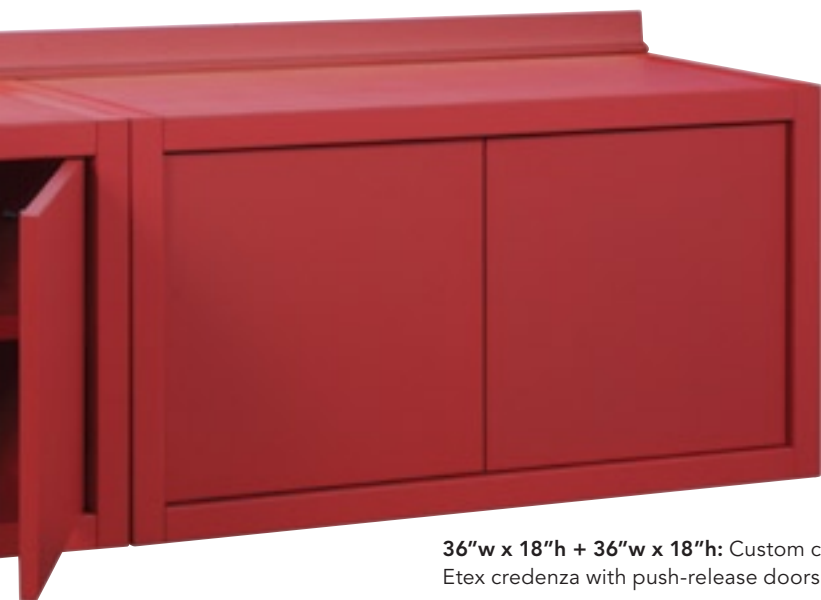
36" w x 18" h + 36" w x 18" h: Custom color Etex credenza with push-release doors.