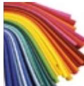
Thousands of fabric options available.