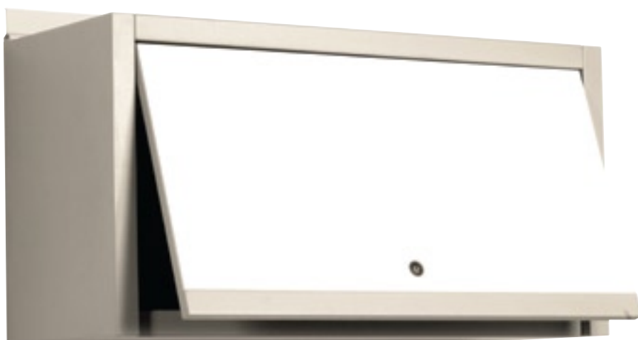
36" w x 18" h: Putty Etex hutch with flip-up door.

Egan's Custom Response Program is built on the foundation of enabling our clients and designers to create specialized products. Our manufacturing systems are versatile and well appointed for custom work on volume orders.