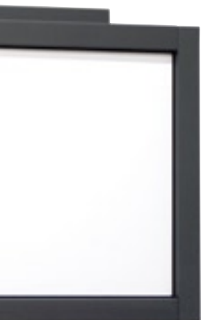
36" w x 18" h: Charcoal Etex hutch with push-release doors.